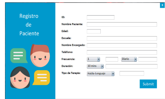
Figure 2 New Patient Module

This module receives input from user of all the information of patients such as Name, phone number, parents' or legal guardian information, age, school, type of service, frequency of service and duration. Figure 2 shows the design.