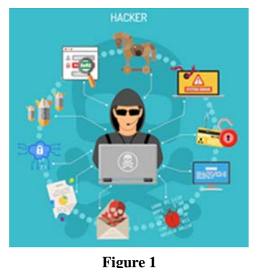
Types of Malwares

Malware is a type of software or application that intentionally damages a device, such as a computer or mobile phone, causing disruption, leakage of private information, unauthorized access, deprivation of access, or unknowingly interfering with a user's computer security and privacy. It comes from the English word "malicious software" and is derived from the union of the word's malicious software and malicious software [3].