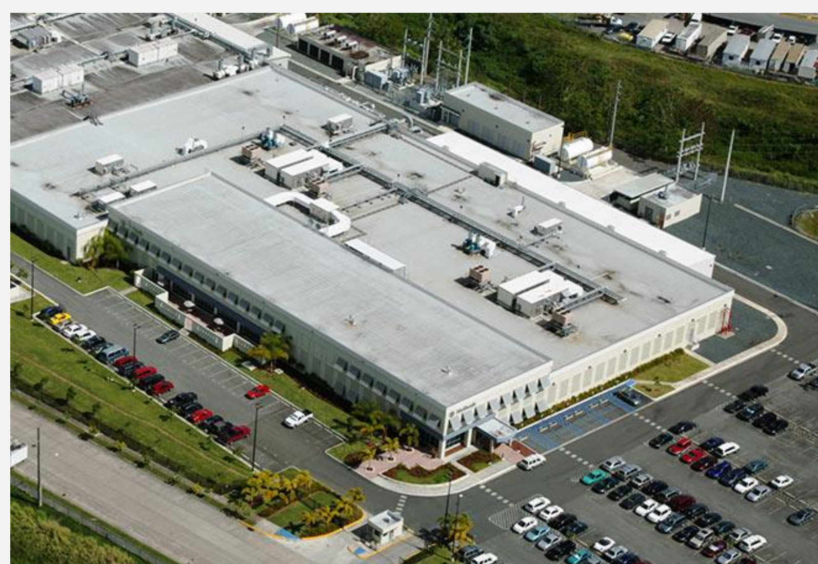
Figure 1: Global company producer of medical devices and therapies

This project was performed at a global company producer of medical devices and therapies which is developing a new manufacturing device in which the processes or machines of cell 1 were already validated. The project is under validation of cell 2 machines which were improved.