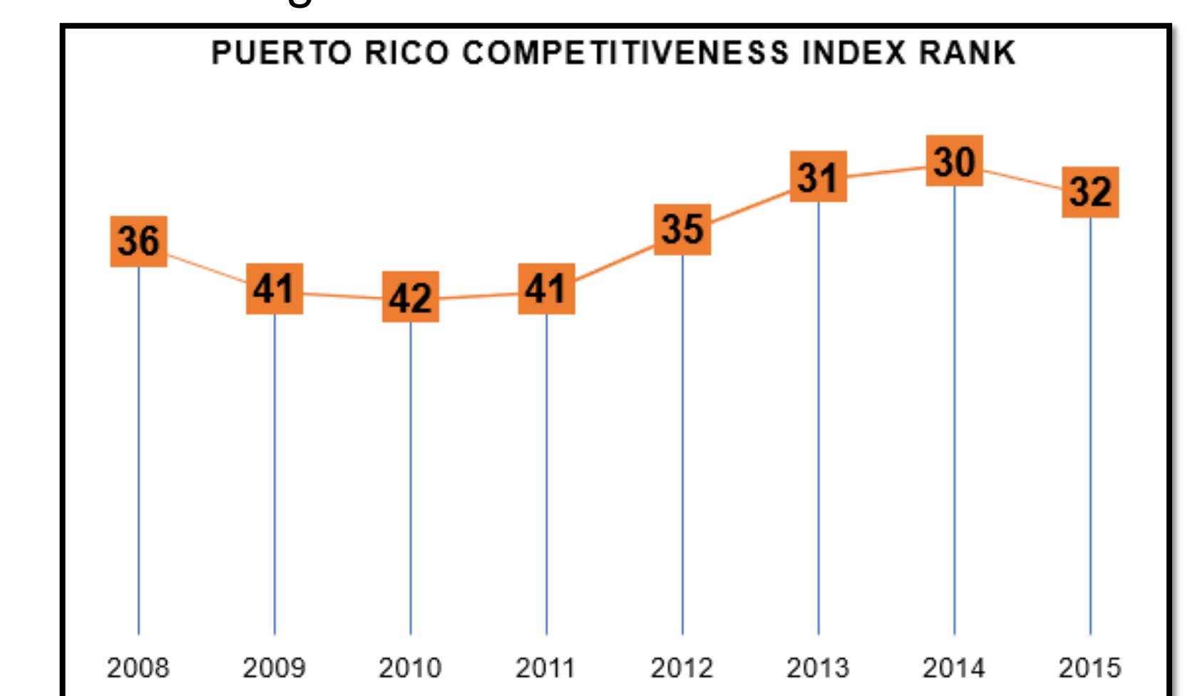
FIG 2: WORLD ECONOMIC FORUM COMPETITIVENESS REPORT, (2008-2015)

Puerto Rico has participated in WEFCI for almost a decade (2008-2015) The lowest rank Puerto Rico had was 30 in 2014 and the highest 42 in 2010. The last year Puerto Rico competed in the WEFCI was in the year 2015 with a 32 as ranking, after that year the Island has not participated because is productivity has not maintained the rigorous criteria the organization needs to evaluated us.