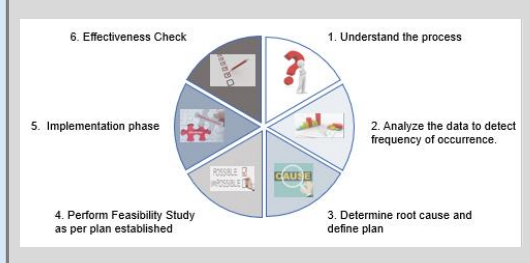
Figure 1 - Cyclical phases of the project

There are ten critical steps to handle a complaint [1], but three that stand-out for the objectives being pursued are the complaint evaluation to determine is validity, the complaint investigation where a root cause analysis must be performed as a mean to tackle the nonconformance, and the implementation corrections and corrective actions, which may sound equal, but are different in their intention and timeframe of implementation. The PDCA Cycle (Plan-Check-Do-Act) is a good methodology to follow since it allows to properly identify which are those causes that are generating this effect and correcting them through cyclical phases [2]. As detailed in Figure 1, the cyclical phases of the project where from understanding the process, to implementing the effectiveness check.