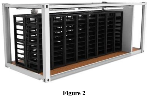
Preliminary 3D Design

up to 16 cabinets, 512kWh. There will be two HVAC units mounted on the left wall (not shown). On the right end, there is a compartment that is intended to house the microgrid controller, DC combiner, power meter, protective relays, load control relays and even some of the commonly used storage inverters. The company's main product is the battery, thus why it was an important item to remain inverter agnostic. To achieve that it was decided to have the storage inverter in a separate enclosure and not in the same enclosure as the batteries. This also simplifies the certification part, because if the inverter was included in the same enclosure with the batteries a series of additional testing must be performed on the system.