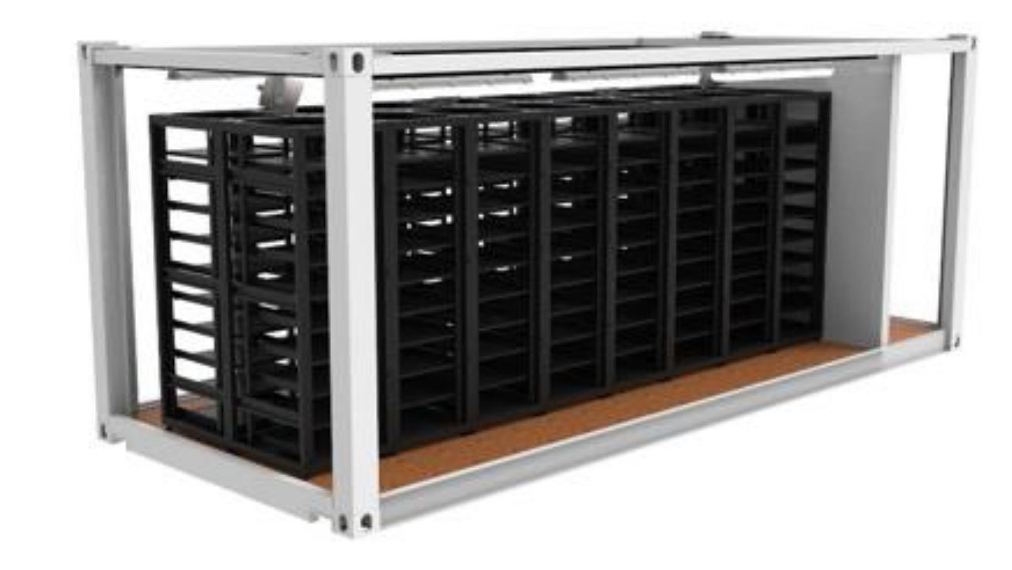
Figure 2 Preliminary 3D Design

Figure 2 shows the 3D design preview of the system. Through the preliminary 3D design, it was proved that a 20 feet ISO container is enough space to house the batteries and all related equipment needed to make the solution code compliant in the US. It can be observed that the enclosure can house up to 16 cabinets, 512kWh. There will be two HVAC units mounted on the left wall (not shown). On the right end, there is a compartment that is intended to house the microgrid controller, DC combiner, power meter, protective relays, load control relays and even some of the commonly used storage inverters. The company's main product is the battery, thus why it was an important item to remain inverter agnostic. To achieve that it was decided to have the storage inverter in a separate enclosure and not in the same enclosure as the batteries. This also simplifies the certification part, because if the inverter was included in the same enclosure with the batteries a series of additional testing must be performed on the system.