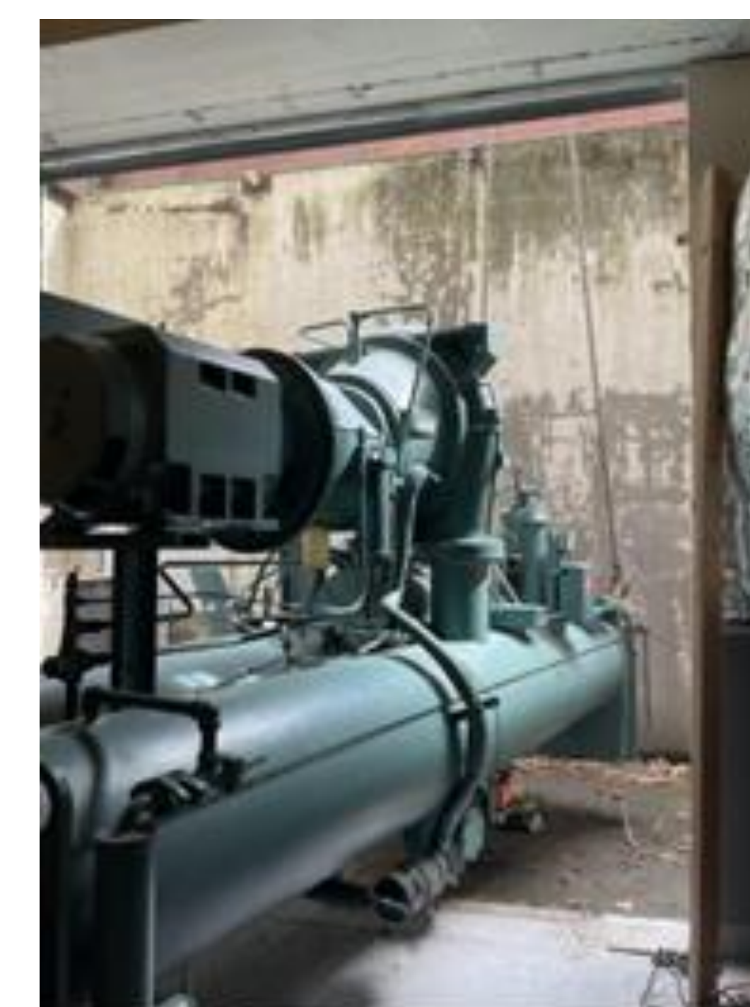
Figure 3: Removal of 200-ton Chiller

The contractor had to hire a local subcontractor to remove the doorframe and demolish part of the wall to be able to fit the old Chiller 2 (CH-2) through that door and then inserted the new 135-tons pony chiller with the help of Western Crane operators. P&L Contractors then proceeded to reinstall the double door and frame and made sure that the building was secured. All this happened in a single workday as planned, since the building is a federal courthouse, and it was not an option to leave it exposed to the public. The Figure 3 below shows how the old chiller was being removed from the basement using the crane and the laborers helping by pushing the chiller through the double door.