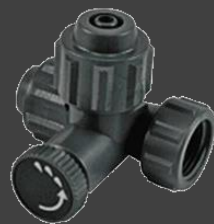
Figure 1 Bleed Valve Assembly

The purpose of this phase is to determine user needs to build team knowledge and understanding of the project. On this project the team were working a redesign of a Bleed Valve Assembly in order to get a cost reduction. Figure 1 shows the Bleed Valve Assembly.