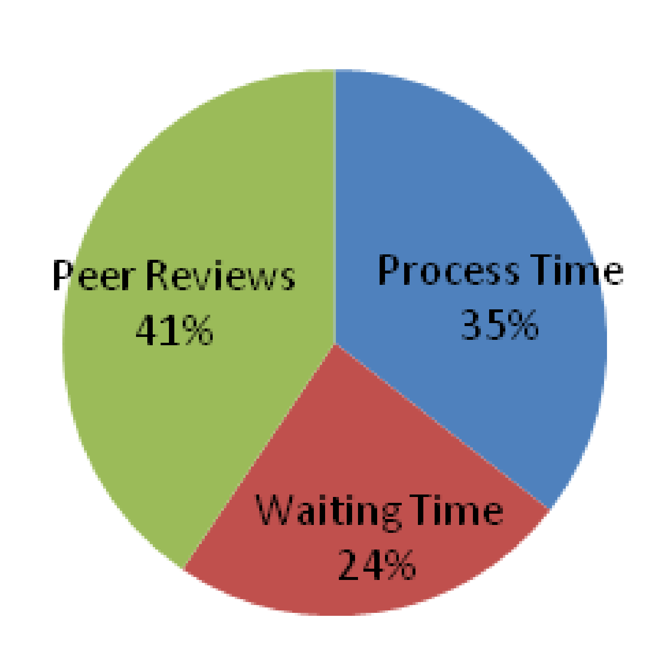
Figure 1 Time Consumption of Current State of Process in Percentages

The Peer Reviews are still part of the Waiting Time, but taking into consideration the lack of quality inspectors and that those reviews cannot be automated, they were separated into their own category.