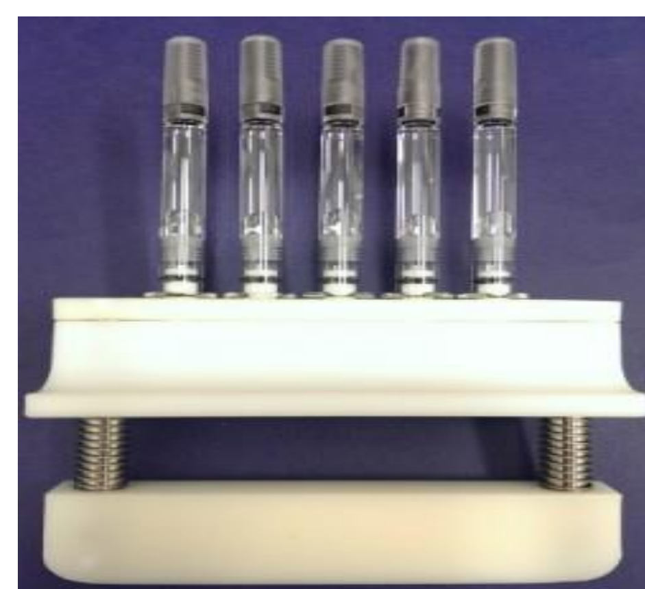
Figure 2 Proposed Holder with Syringes