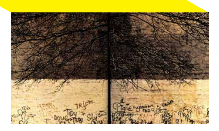
Figure 4. (top) Example of Chicano gang roll call, circa 1970. (Image by Howard Gribble)

Figure 5. View of tag-covered Lexington Avenue express subway car. (Image by John Naar)