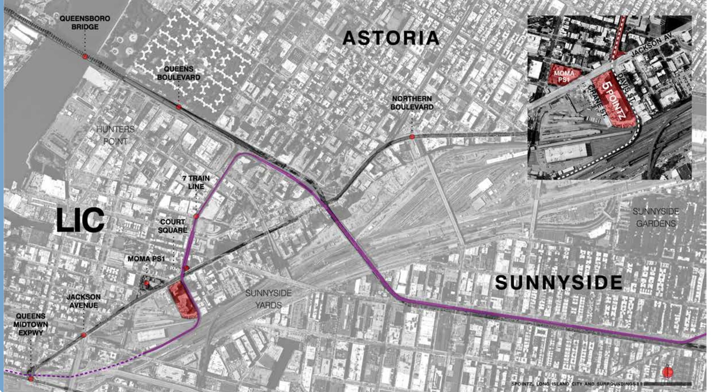
Figure 3. Regional map situating 5Pointz within main landmarks, major neighborhoods and surrounding infrastructure. (Image by Edward A. Aguilera Pérez)

centers, it must have a certain depth of understanding of the evolving meanings of urban space and how these relate to the experience of different and specific groups in society. Class conflict, race, religion and violence: it is all truly there,