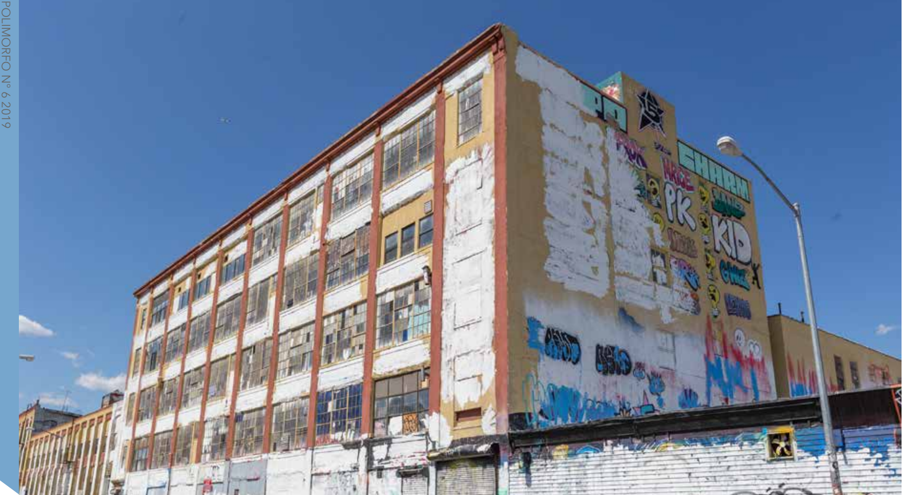
Figure 7. View of 5Pointz after the incident of whitewashing.

has stirred the discussion around artist rights and the extent to which the State negotiates the constructs of property around a wall and the copyrights of aerosol artists to their work. The issue of property has, in a sense, always been in the DNA of graffiti, be it through the specific regulations surrounding it within the NYC capitalist economy, the shifting boundaries of the public sphere and of who partakes in it, as well as the evolving meanings of the ways in which the people engage with these walls. Of relevance may also be the dispute around the