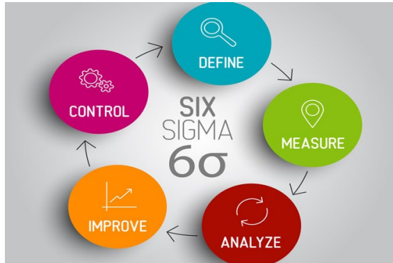
Figure 1 DMAIC Methodology

processes and products. It is used to identify, analyze, and solve existing processes that are inefficient or ineffective. The approach breaks down into five phases: Define, Measure, Analyze, Improve and Control (See Figure 1). Each phase builds upon the previous one to identify potential solutions for the problem at hand. With this method, organizations can focus on eliminating waste and defects while improving customer satisfaction and profitability.