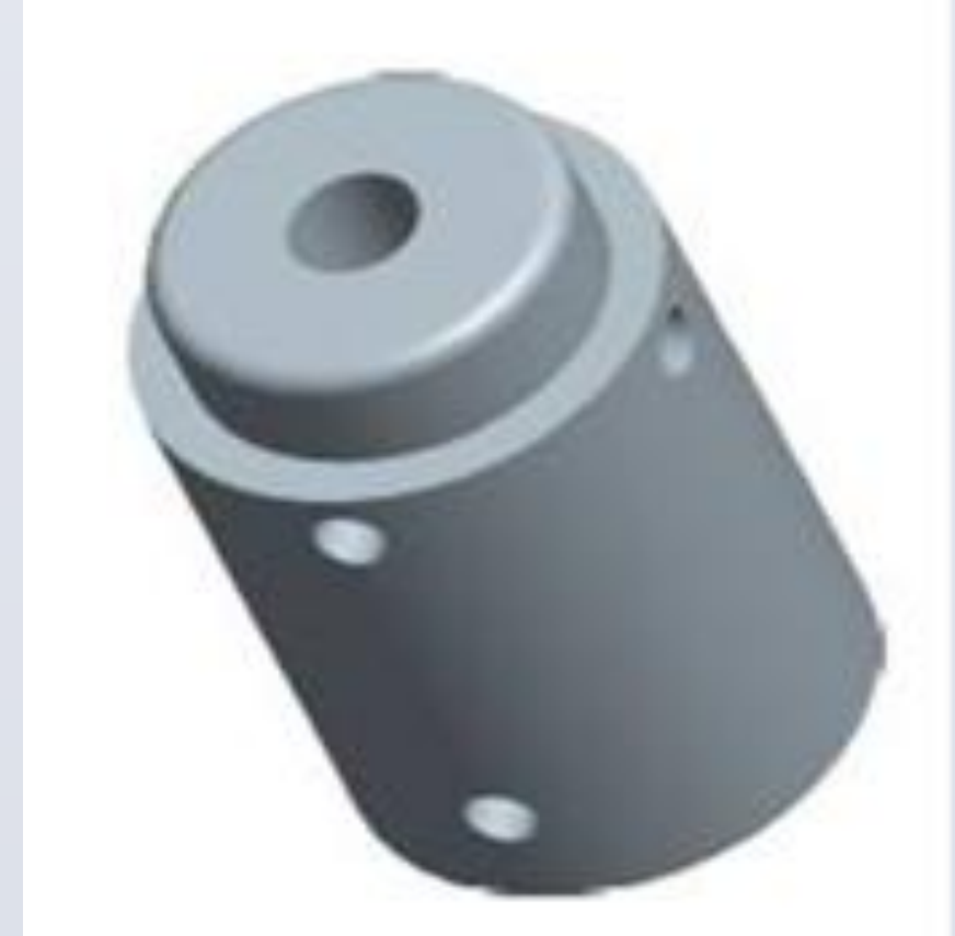
Figure 3: Centering Fixture Support Base