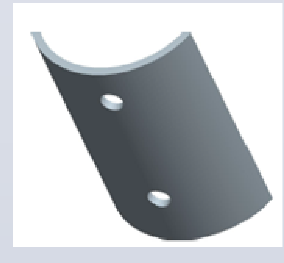
Figure 4: Centering Fixture Front Plate