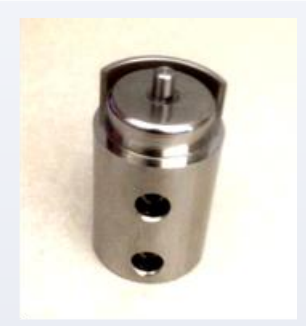
Figure 5: Tungsten-Carbide Centering Fixture

As can it be observed in Figure 6, yield has been consistently reported to be higher than 95% since the change was implemented. If this trend continues it can be concluded that the wear on the centering fixture was the main contributing factor and root cause of the underperforming yield. Moreover, the improvement project can be considered successful and effective at meeting the objectives to reach the KPI goal of at least 95% and providing a cost avoidance of over $12,000 monthly.