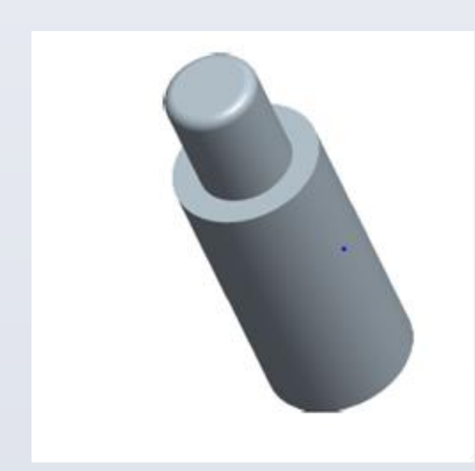
Figure 2: Centering Fixture Support Pin

Therefore, Solution #1 was pursued and implemented. Fixture design as shown in Figure 2, Figure 3 and Figure 4 was sent to a machine shop approved supplier for machining.