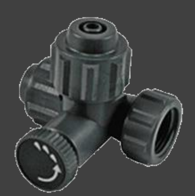
Figure 1 Bleed Valve Assembly

The purpose of this phase is to determine user needs to build team knowledge and understanding of the project. On this project the team were working a redesign of a Bleed Valve Assembly in order to get a cost reduction. Figure 1 shows the Bleed Valve Assembly.