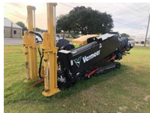
Figure 1: Vermeer Boring Machine

•The main purpose is to implement a Total Productive Maintenance towards their state-of-the-art boring equipment. The main purpose of this equipment is to perform Horizontal Directional Drilling without affecting traffic or the environment. Therefore, the equipment is very sensitive to failures and downtime if not looked after daily. The main problem is that the machine is down 40% of the time. Hence why TPM will be implemented to support this equipment.