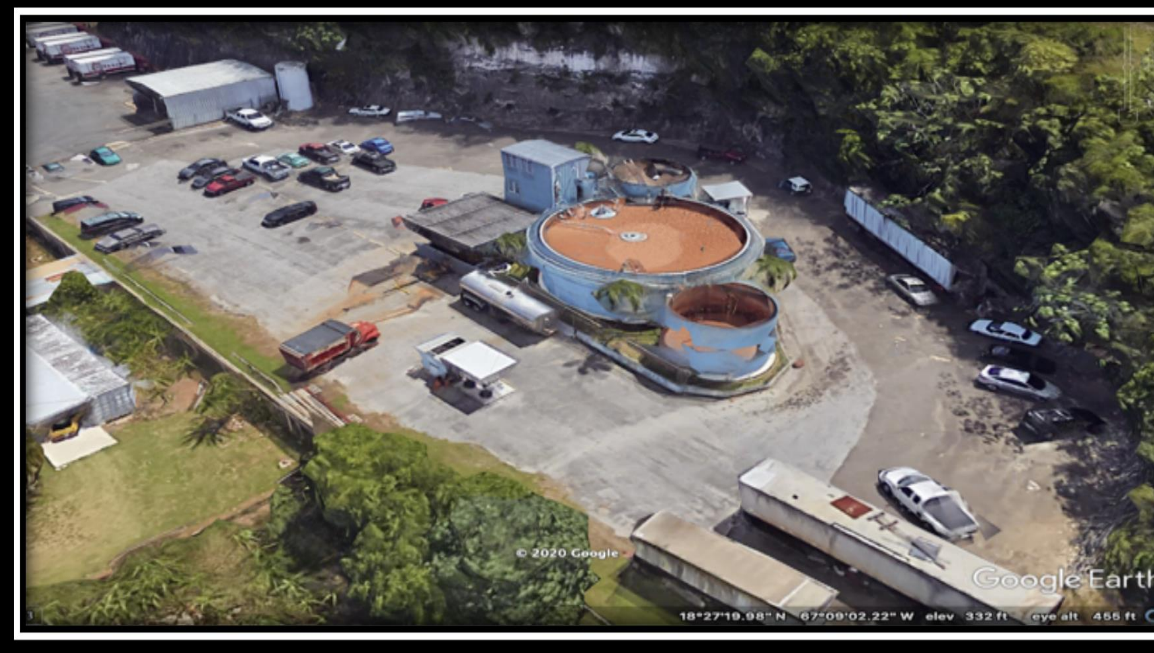
Figure 2 Before "Vida" Plant Expansion Water Treatment Plant

In the month of July, 365 gallons were hauled, and the cost was $18,290, while in August 709,044 gallons were also hauled with a total cost of $35,452, and in September 691,200 gallons were hauled for a total of $34,560, for a total amount of $88,302 for three months. If we estimate that for a year, it would be a cost of $350,000. This is money that is being lost for not having a plant with the necessary improvements to manage those 120,000 gallons per day.