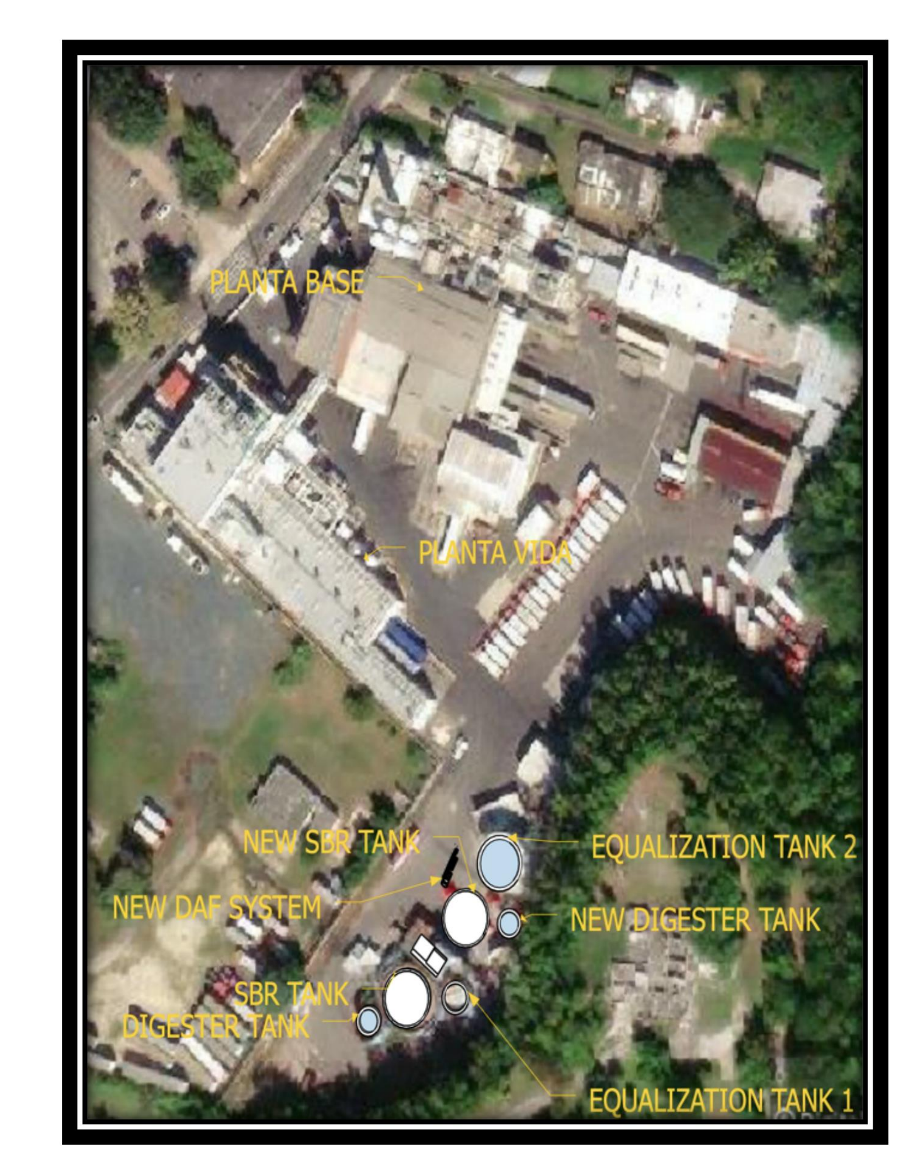
Figure 3 Diagram after Improvements of Water Treatment Plant