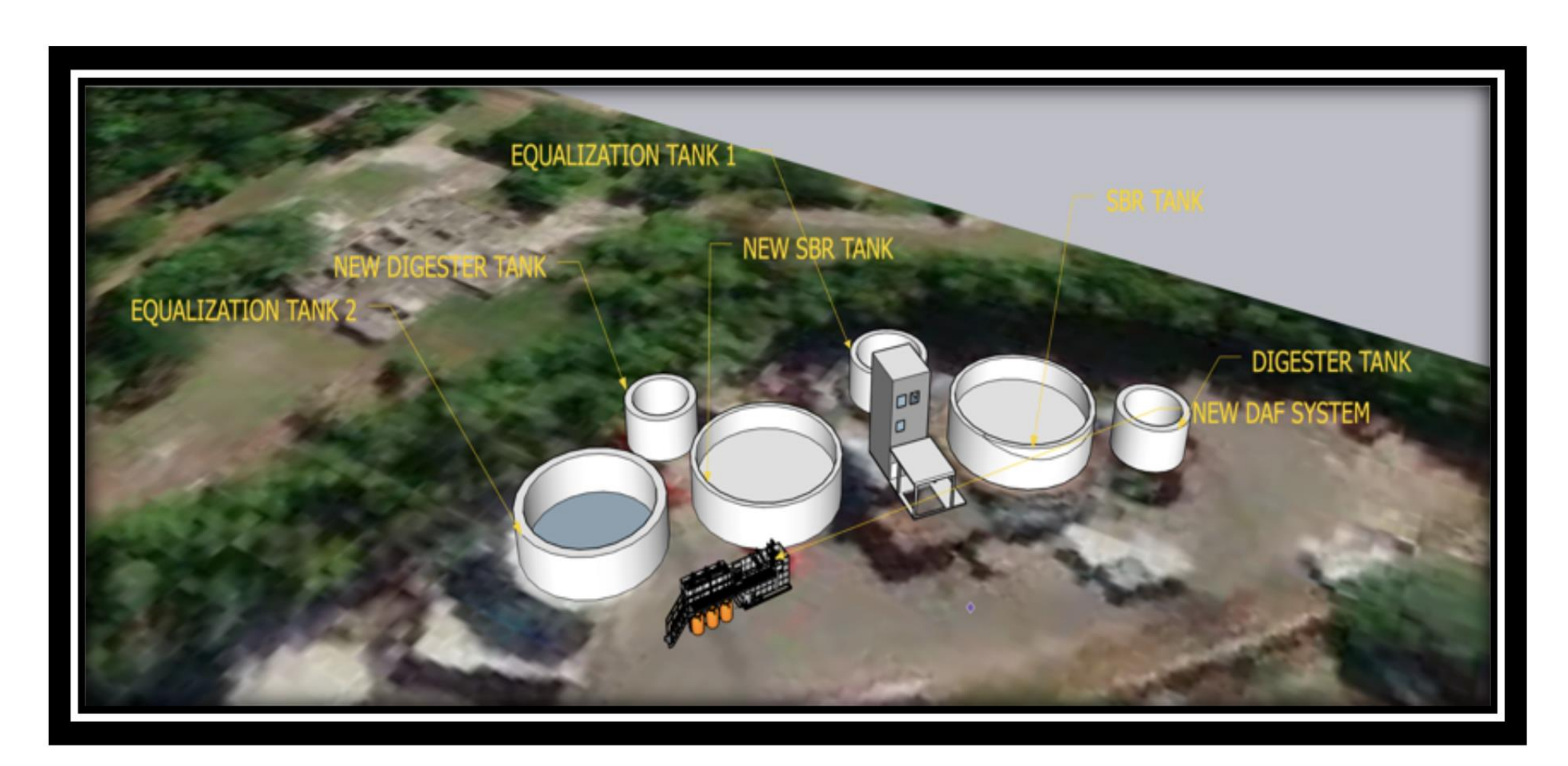
Figure 1 Diagram after Improvements of Water Treatment Plant

The improvements that will be made to the water treatment plant in Aguadilla are to add a DAF (dissolved air flotation) unit system and another SBR system. Also, the plant will need to seek permission from the Puerto Rico Aqueduct and Sewer Authority (PRASA) in order to increase the discharge permit from 80,000 gallons per day to 120,000 gallons per day. Although making this change will allow the company to comply with the permits of discharge, improvements to the plant need to be made in order to handle that amount of discharge. Dissolved air flotation is used in certain treatment plants to separate solids, oils and greases. Typical removal efficiencies are 70%-98% of total suspended solids (TSS), 40%-60% of biochemical oxygen demand (BOD), 80%-95% of oils and grease and 70%-95% of metals. Because of this, the dissolved air flotation system will lower 4,000 gallons per day of water that will go to the sequencing batch reactor because of all the typical removal efficiencies or wastes. A new SBR system will help treat the amount of water that goes into the plant to be treated. Doubling the size of the equipment will help to treat all the amount required to treat those 120,000 gallons per day. A comparison will be made to compare the cost of having another SBR tank operation and a DAF unit system to compare with the expenses of hauling the excess of water. Below are the formulas used for the design of the DAF and SBR system equipment