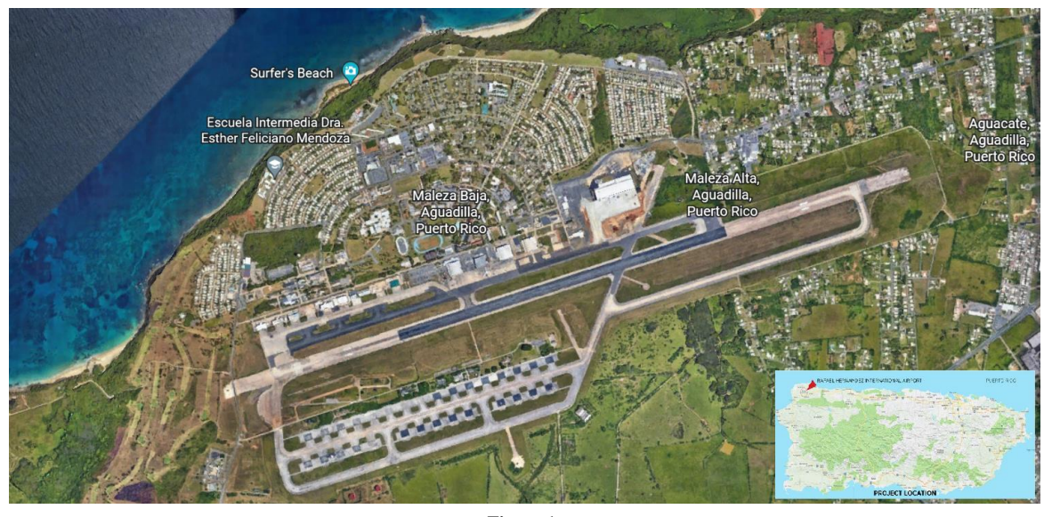
Figure 1 Location map

designated as "clean 53", since it can be compacted and in turn allows water to flow through while keeping underground areas safe. [2] The location of the drainage system within the Runway Safety Area (RSA) is a major concern for the project, therefore the project Runway 16C-34C rehabilitation at Seattle-Tacoma International Airport, Washington State was reviewed. This project included the reconstruction of the road and the replacement of the rainwater system located within the RSA. To successfully complete this reconstruction a variety of requirements for pipeline approval within this area were needed to be met. [3] For the PRPA it is essential to minimize the disruptions to the airport operations. hence the project Lambert Taxiway/Runway Rehabilitation at St. Louis Lambert International Airport Missouri was studied. During this project the biggest challenge was carrying out the construction while parts of the pavement were actively operating. To deal with this situation, the construction was divided into stages, that allow the passage of the aircraft on one side of the taxiway, while the other side was under construction. [4]