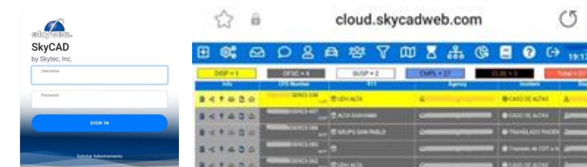
Figure 1: Example of SkyCAD, a computer-aided dispatch system. As part of our research, we were granted supervised access to SkyCAD, a computer-aided dispatch system utilized in Puerto Rico for emergency call management. With guidance from our expert interviewee, we explored the functionalities of SkyCAD to assess its strengths and weaknesses and draw comparisons to our proposed solution, the Be Safe app.

During our investigation into the emergency response system in Puerto Rico, we conducted an interview with a seasoned expert who provided valuable insights based on their 12 years of experience as a first responder. The interview highlighted the need to reduce response and assignment times, as well as the potential benefits of utilizing real-time video footage in emergency situations. Building upon these insights, we proceeded to analyze real emergency response data to assess the current system and explore how the Be Safe app could enhance response times and overall efficiency. The subsequent Data Analysis and Results section presents our findings and discusses the potential impact of the Be Safe app on Puerto Rico's emergency response system.