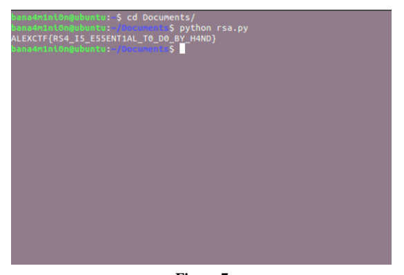
Figure 7 rsa.py Output with Secret Message

After running the script, we got the following output. See figure 7 below.