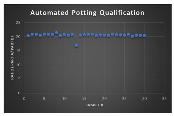
Figure 2 Accuracy and consistency of the adhesive mix ratio over multiple tests

The team conducted extensive tests on the machine to ensure its optimal performance as shown in Figure 2. These tests focused on the dispensing speed and consistency of the compound. Based on the test results, the necessary adjustments were made to the hardware and software configurations to improve efficiency and accuracy.