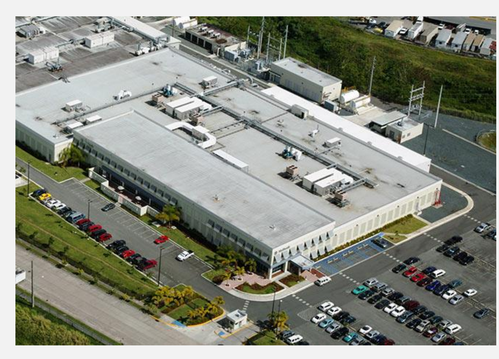
Figure 1: Global company producer of medical devices and therapies

This project was performed at a global company producer of medical devices and therapies which is developing a new manufacturing device in which the processes or machines of cell 1 were already validated. The project is under validation of cell 2 machines which were improved.