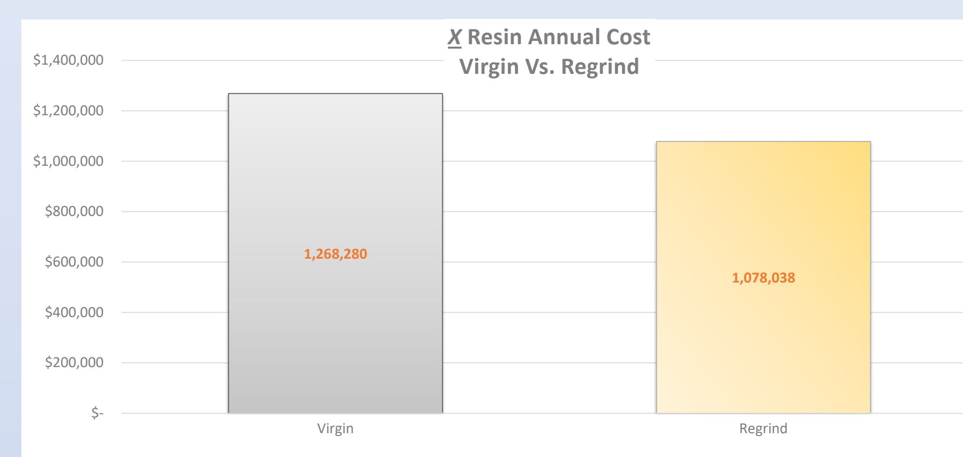
Figure 3 Virgin Material versus Regrind Material Cost Comparison