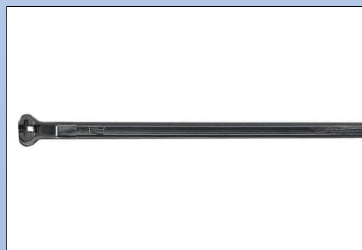
Figure 1 TY27MX

Since the first quarter of 2020, ABB Caribe, an electrical device company specialized in cable ties manufacturing, identified high levels of scrap in the production line corresponding to the TY27MX catalog, shown in Figure 1. The molding process for this product requires about 117,000 pounds of resin X per quarter. However, process variation and inherent conditions are affecting material consumption, which increases scrap production up-to 15% approximately. By implementing the use of X regrind, a scrap reduction will be achieved with estimated cost savings of $190,000 yearly.