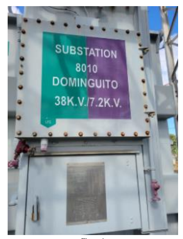
Figure 1 Dominguito Transformer

Figure 1 shows the Dominguito 8010 transformer. Three alternatives were established to eliminate the Dominguito overload. The first alternative was to replace three transmission poles and enable the Arecibo Rural substation 8003. The estimated cost is $21,000. The second alternative was to make an underground repair between the feeders 8007-1 (Mirador Azul) and 8010-3 (Dominguito) to transfer the load from 8010-03 to 8007-3. The estimated cost is $59,000. The third option was to make a transformer convention on 8015-09 (Arecibo SECT). Instead of installing a step-down transformer, the best option is to change the lateral loads to a direct conversion of 13.2 kV. Feeder 8015-09 (Arecibo SECT) passing across the majority of Sub 8010 feeders. It can cost $100,000 or more.