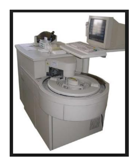
Figure 1 Immunochemical Automated Analyzer

An immunochemical automated analyzer (as shown in Figure 1) is used for quantitative and qualitative measurement of IgG antibodies to toxoplasma gondii in human serum or plasma. This instrument is used in medical laboratories by trained medical personnel. It can process about 100 samples an hour. A multinational healthcare company made this instrument and manufactures the reagents, calibrators and controls need it to process the tests. As part of the manufacture a quality control test is performed in order to determine the optimum sample/control (S/C) ratio of the In-Process Toxo Calibrators B through E.