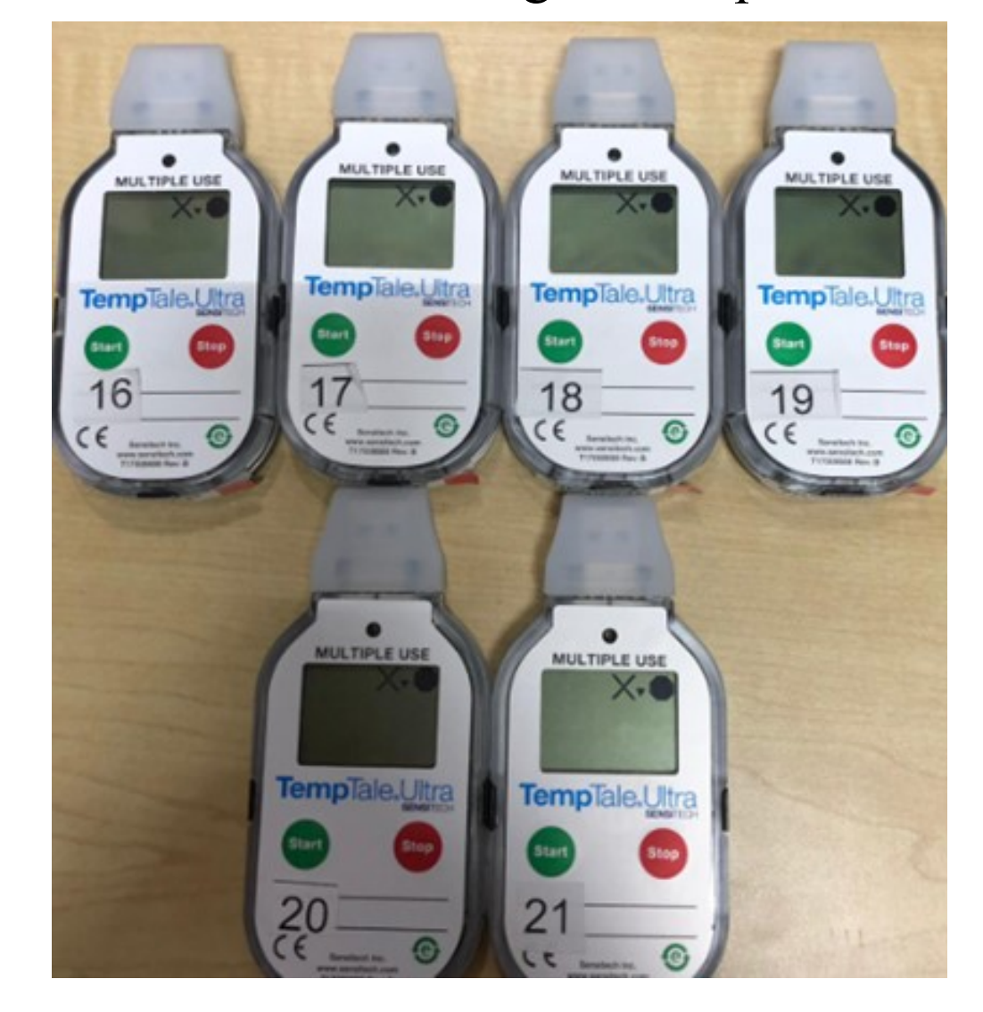
Figure 3 TempTale<sup>®</sup>Ultra sensors in where the temperature excursions were found Sensors B3S16, B3S17, B3S18, B3S19, B3S20, and B3S21 were identify with the temperature excursions, as showed on Figure 3.

Temperature Sensor near the thermostat Figure 2