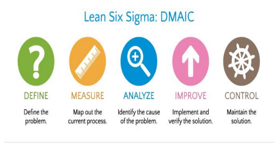
Figure 2 Understanding DMAIC Cycle

Implementation of the DMAIC methodology will also upgrade to the company's preventive maintenance program, which ultimately led to: