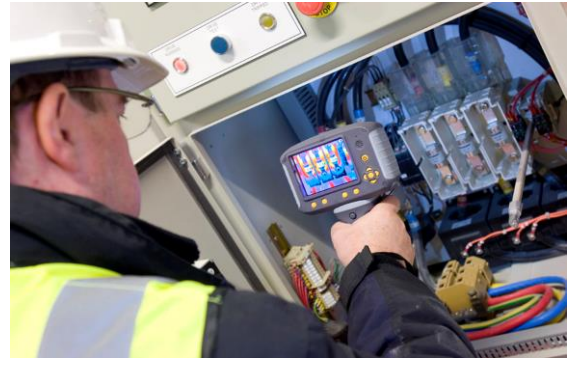
Figure 1 Preventive Maintenance

include partial or complete overhauls at specified periods, oil changes, lubrication and so on. In addition, workers can record equipment deterioration so they know to replace or repair worn parts before they cause system failure. The ideal preventive maintenance program would prevent all equipment failure before it occurs.